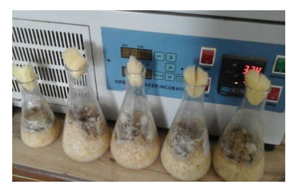
Fig. 1 A 10-day culture of P. chrysosporium

MRC Orbital Shaker Incubator. Oxygen was introduced into the culture by partially covering the flasks with a piece of foam as shown in Fig. 1. Fungal growth was assessed to be efficient after the incubation period by visual inspection.